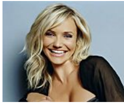
10 Celebrities Known For Their Bad Hygiene Answers