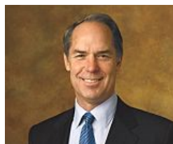
Headhunter reportedly compiling list of replacements for BNY