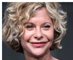
20 Stars Who Are Aging Terribly...#6 Will Make You Cringe!