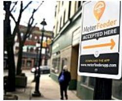
'Smart' parking arrives in Dormont