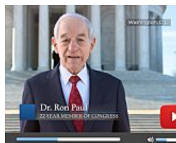
New Ron Paul Video Goes Viral — Over 450,000 Views