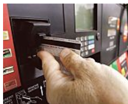
Are gas-brand credit cards running on empty?