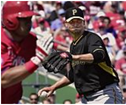
Pirates to place Charlie Morton on DL