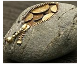
"Shark Tank" Star Reveals Brilliant Mortgage Payoff Tip Bills.com