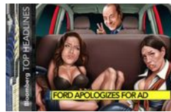
Ford Apologizes for Unauthorized Ad Q