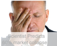
Scientist Predicts 60% market collapse