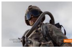
Super Human Reality: Lockheed's Bionic Exoskeleton Q