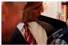
Obama, Buffett, the Dalai Lama: Their Favorite Pen Q