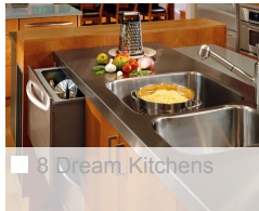
8 Dream Kitchens