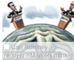
Can Romney recover? Markets think

Bloomberg moderates all comments. Comments that are abusive or off-topic will not be posted to the site. Excessively long comments may be moderated as well. Bloomberg cannot facilitate requests to remove comments or explain individual moderation decisions.