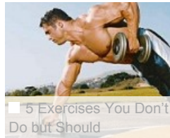
5 Exercises You Don't Do but Should