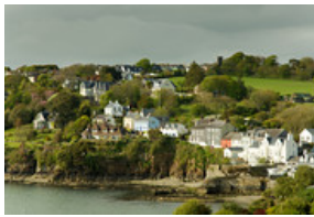
10 best places to retire abroad