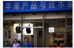
Why China wants to eat Apple