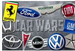
Ford is ready to step on the gas