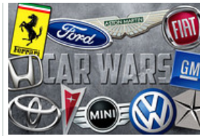
10 iconic Hollywood cars